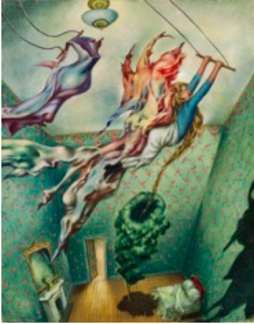
Dorothea Tanning, Avatar, 1947, oil on canvas, 14 x 11 in., Private Collection