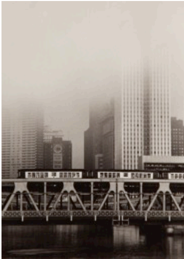
Yasuhiro Ishimoto, Untitled, Chicago (El Over River) , c. 1950, silver gelatin print, 7 1/4 in x 10 in., Collection of DePaul Art Museum, Gift of Stephen Daiter

DEVELOPED IN PARTNERSHIP WITH MORE THAN 40 CULTURAL ORGANIZATIONS IN AND OUTSIDE OF CHICAGO, INITIATIVE WILL FEATURE EXHIBITIONS, PUBLIC PROGRAMS, SCHOLARLY PUBLICATIONS, AND A MULTI-PART DOCUMENTARY